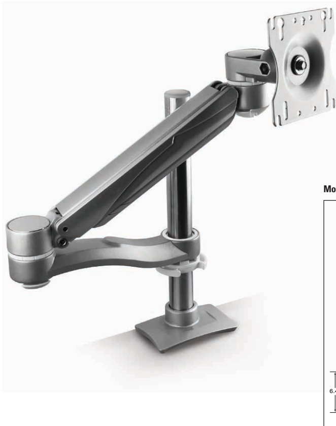
Monitor Arm Specifications

Monitor Arm - Single Screen/Dual Extension/Height Adjustable, model EVLCD04. One part workhorse, one part museum piece, this monitor arm continues in the fine tradition of its predecessor and builds on a sterling reputation.